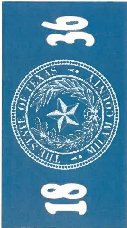
Current Milam County Flag