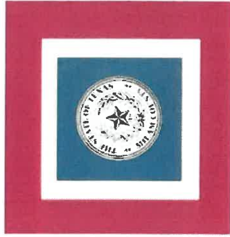
Proposed flag #3