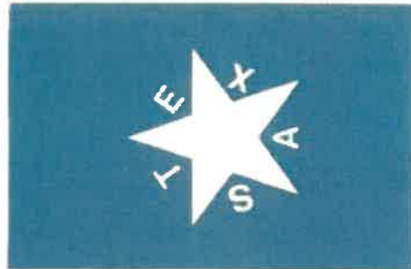
Proposed Flag #2